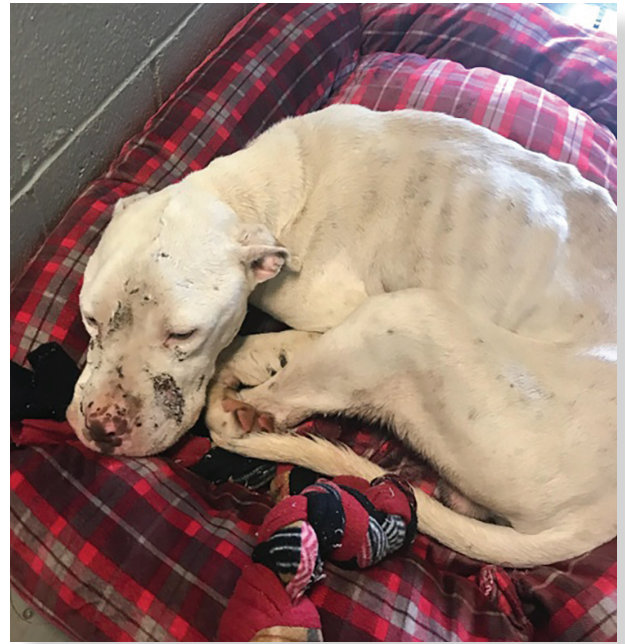
A happily ever after ending usually doesn't start off well.