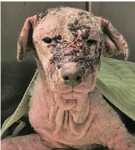
When Coco first arrived at the shelter.

In early November, a stray puppy was brought into the Aiken County Animal Shelter by one of the animal control officers. Her face was dripping blood, she had no fur, and she was just a baby!